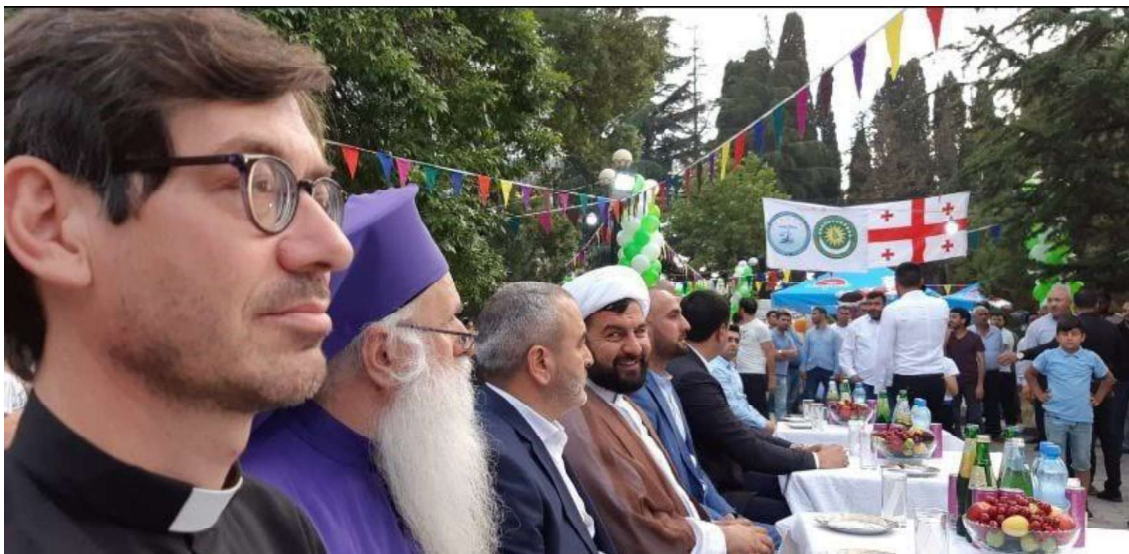
An interreligious breaking of the fast of ramadan in 2019 in Georgia.